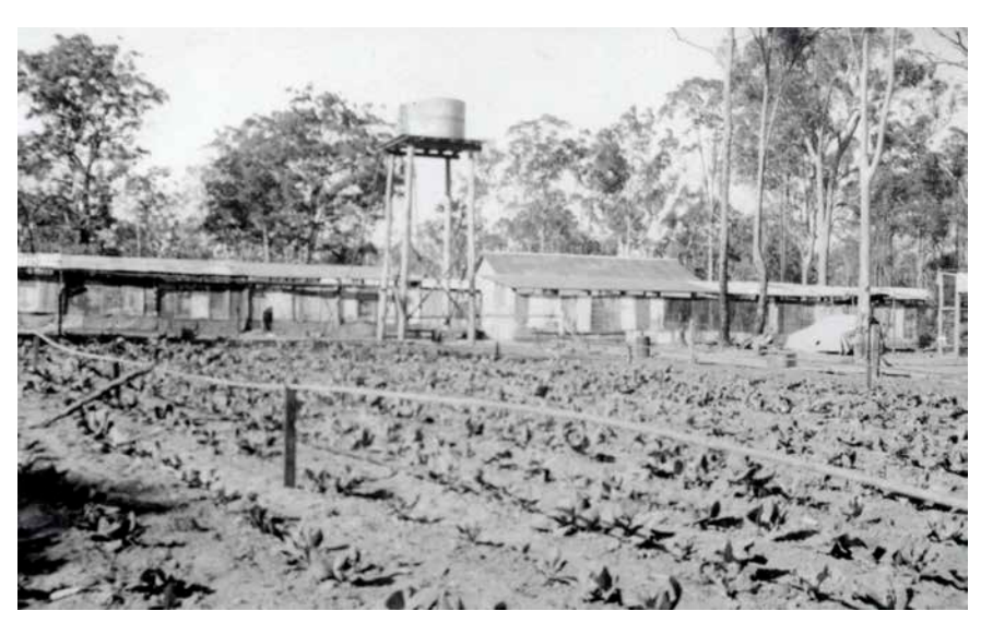
A field, well fertilised with chicken manure, growing vegetables, while behind are large poultry sheds and a tank to gravity feed water for irrigation. Note makeshift irrigation-pipe, July 1943.