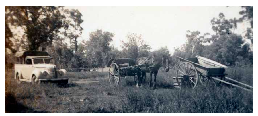
Transport options: Ford truck, Major hitched to dogcart, and a dray, Paxton, 1943.

came there from across Australia.<sup>45</sup> They raised poultry for eggs and meat, grew and sold vegetables, and sold charcoal and firewood, including under contract to a wool-scouring firm. Using demolition materials, they were building more communal housing and farm sheds, and acquiring, or building, better equipment as fast as they could.<sup>46</sup>