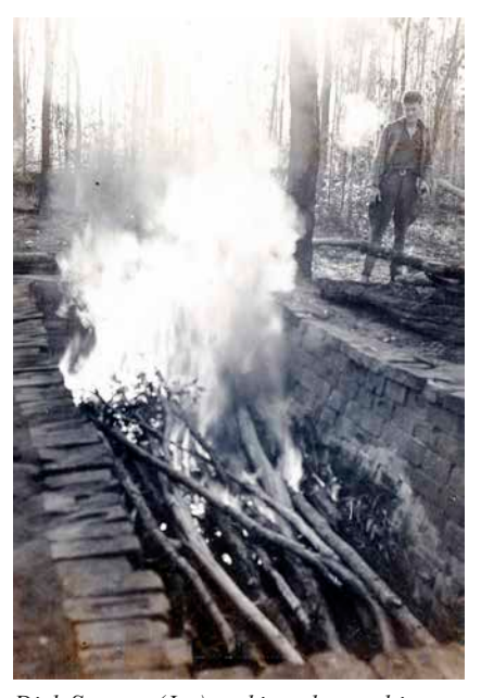
Dick Souwer (Jnr) making charcoal in one of their brick pits, early 1942.

During 1942 Paxton communards tried to harvest and sell their bountiful timber for lumber. When that failed they started to sell it as firewood, and used some to produce charcoal. They had three brick-lined pits and were able to produce top quality charcoal that they used to power their cars and truck, and sold the rest. Charcoal-fuelled cars were common because of wartime rationing of petrol. They had an old caravan, equipped as a mobile kitchen, to feed homeless people should Brisbane be bombed.<sup>28</sup> This