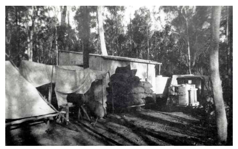
From left, large tent for sleeping, shed for cooking and socialising, bags of charcoal for sale, their old Buick car fitted with charcoal burner on rear, April 1942.