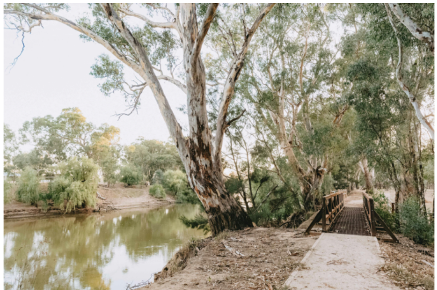
Google image of Wagga Wagga

One of the things I wanted to talk about with you is in your capacity as an historian with the tapestry project. We have an embryonic plan for an art and craft fundraiser here in Wagga Wagga some time next year. We are thinking about selling art, lithographs and crafts with a percentage going to QSA. There might be raffles and auctions depending on the quality and quantity of work. One of our ideas is to have a display of some of the tapestries as a focus with particular emphasis on scenes that may be relevant to regions and Riverina. Dunera springs to mind. Do you think it might be possible to arrange a loan of some of the pieces? I have no idea where they are held and who is the main custodian, hence my turning to you.