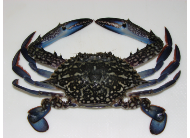
This is a picture of the famous Mandurah crab.