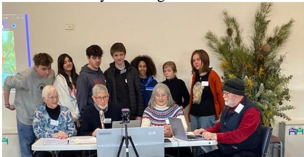
JYFS BEHIND THE YM TABLE

To understand the Yearly Meeting there are two essential documents – Documents in Advance and Documents in Retrospect . Both are essential reading for an understanding of Australia Yearly Meeting.