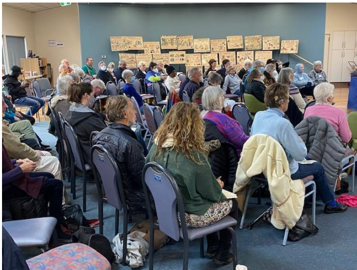
THE YEARLY MEETING IN SESSION

Yearly Meeting 2024 at The Retreat, West Beach, on the 6th - 13th of July was highly anticipated by the hard-working Local Committees and Yearly Meeting Organisers as well as the Australian Quaker