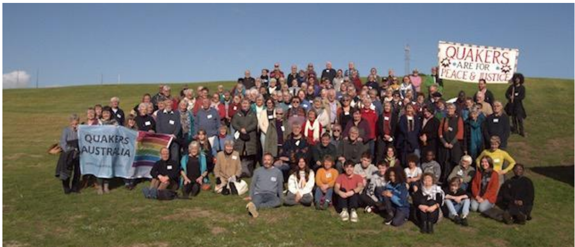
YEARLY MEETING 2024 PHOTO

(Final paragraph from ‘Nothing Lowly in the Universe’, by Jenny Ratcliffe, the Crundale